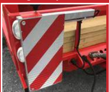
Pull out marker board