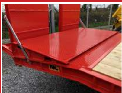
Bolt-On Bale Wedge (Cheese Wedge)