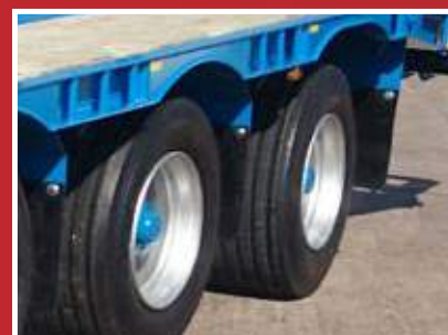
Rear steering axle