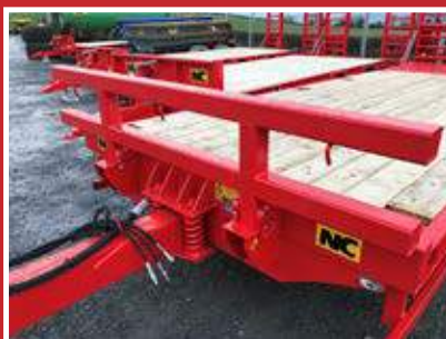
Double T Bar Headboard