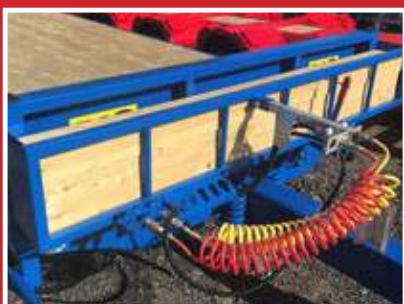
Headboard Outrigger Storage Tray