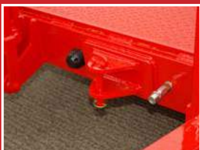
Rear Tow hitch