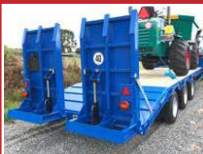
Durbar Sheeted ramps