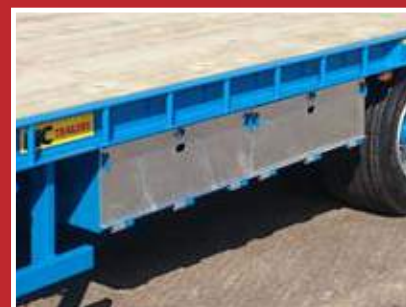
6ft Steel Tool Box